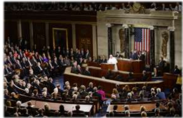
Pope speaks to Congress 07/24/2015

http://www.usatoday.com/story/opinion/2013/10/26/united-states-vatican-president-obama-column/3182013/